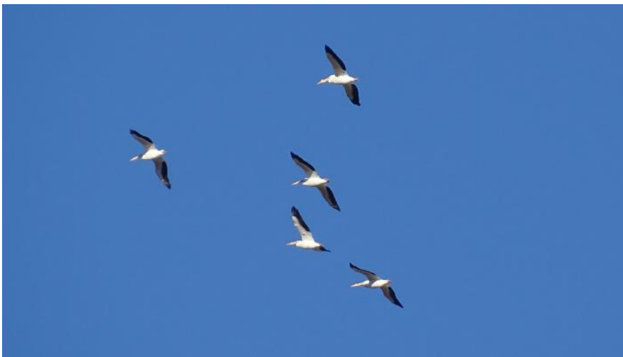
Those white and black birds at the field were American White Pelicans migrating north on 9-foot + wings!