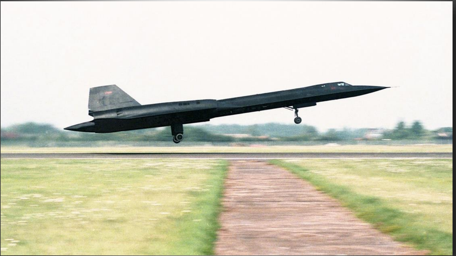
SR-71 Departing Royal Air Force Mildenhall Air Station in England.