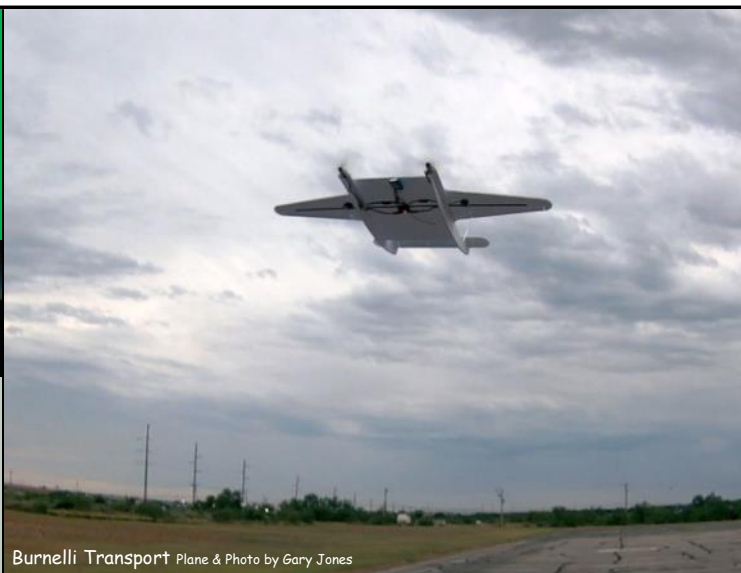
Burnelli Transport Plane

https://www.youtube.com/watch?v=PcWOHfniy3g