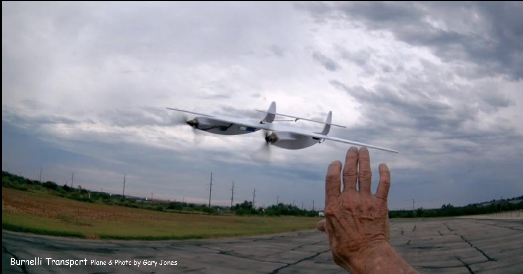
Burnelli Transport Plane & Photo by Gary Jones

October 10-12 West Texas Fly In Angelo RC Field San Angelo