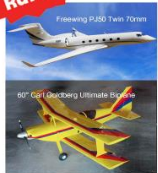
Freewing PJ50 Twin 70mm