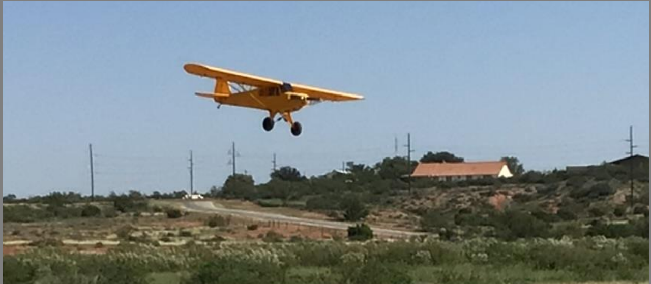
Norman Watters 12 Foot Hemphill PA-18 Super Cub