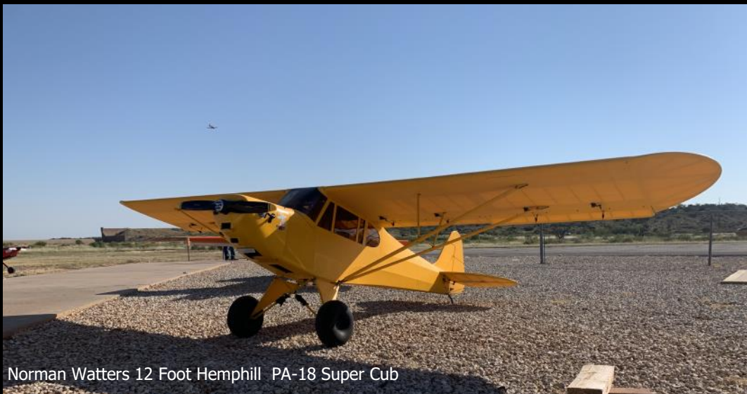
Norman Watters 12 Foot Hemphill PA-18 Super Cub