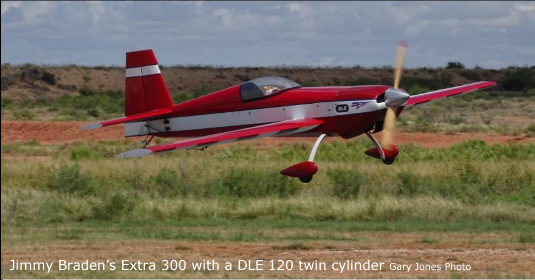
Jimmy Braden's Extra 300 with a DLE 120 twin cylinder

Friday Saturday Sunday Oct 13-15 ARC 42nd Annual Outdoor Fly In San Angelo RC Field