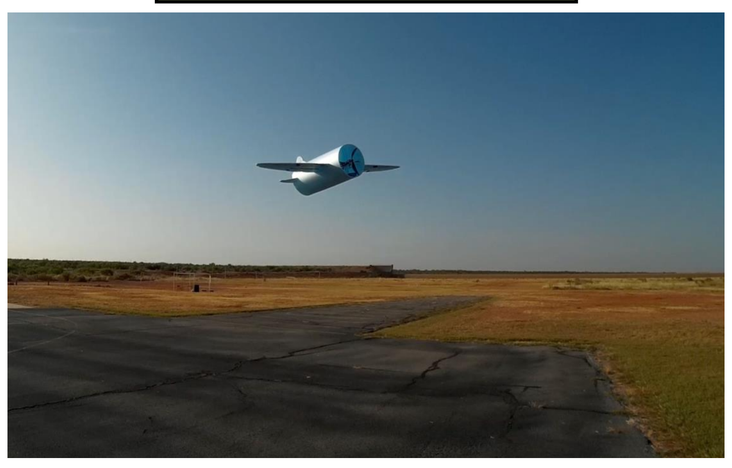
The real deal... <u>https://en.wikipedia.org/wiki/Stipa-Caproni</u>